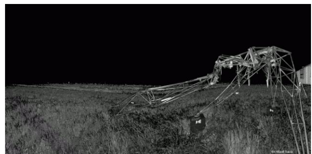
Figure 2: The Senster, Colijnsplaat, 2016; screenshot of 3d scan, by Marek Bascik & co.

The project emerged as a bottom-up, non-deadline university endeavour, Senster 2.0 has had quite a long prelude. The idea of working with the piece came up initially in 2009 but until 2016 its progress was intermittent. It began to gather momentum in 2016/2017 when, following successful sale negotiations, the sculpture found its way to Krakow. In this phase the project gained substantial funds, was granted the official support of the university, inter-university agreements were made and media promotion followed. As a consequence deadline obligations were imposed together with a need for structured and effective engagement.